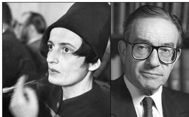
Ayn Rand and Alan Greenspan

corollary, the demonstration of a new moral philosophy: the morality of rational self-interest.” This book advocates Rand's philosophy of Objectivism and expresses her view of human achievement. It describes a United States in which the most creative industrialists, scientists and artists retreat to